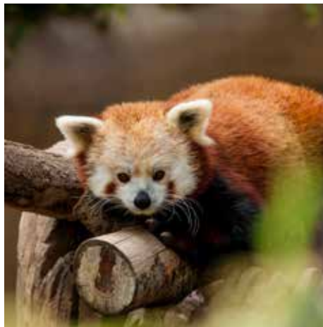
Red Panda at San Diego Zoo

For 100 acres of fun, visit the world-renowned San Diego Zoo with more than 3,700 animals representing 668 species. Camels, giraffes, grizzly bears, elephants, polar bears, and koalas (the largest