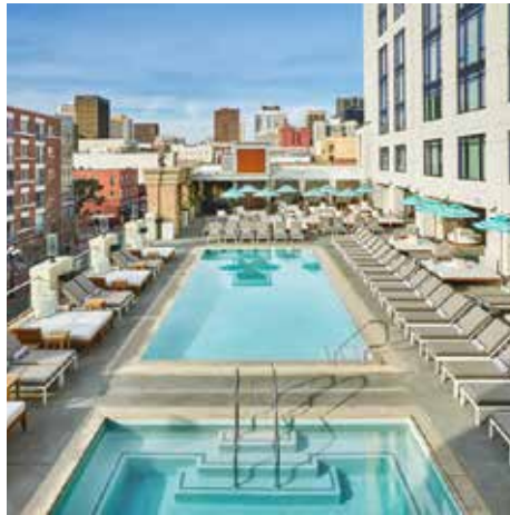
The Pendry pool

Constantly rated in the top 10 parks in the United States, Balboa Park features 16 unique gardens including a Japanese garden and rose garden with more than 2,400 rose bushes. The Botanical Building houses more than 2,100 plants including a fascinating collection of cycads, ferns, orchids and palms. Balboa Park is also home to 15 museums and theaters as well as the world-famous San Diego Zoo , the Old Globe Theatre, San Diego