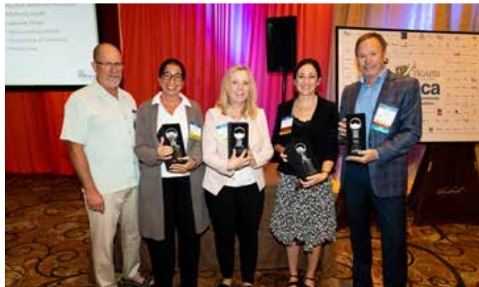
Recognizing some of our founding member organizations: CPC Behavioral Healthcare, Center for Mental Health, Aurora Mental Health Center & AltaPointe Health